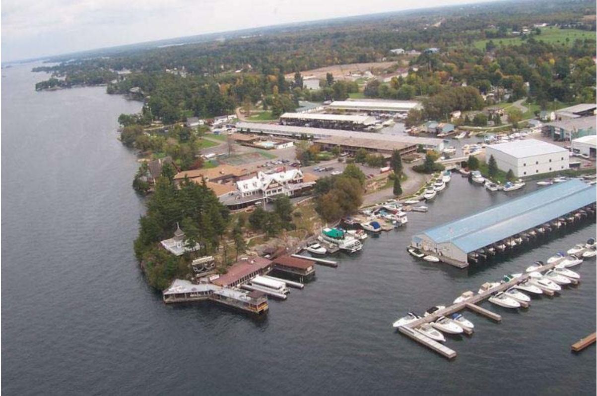
Aerial view of Bonnie Castle Resort located in beautiful downtown Alexandria Bay, Thousand Islands.